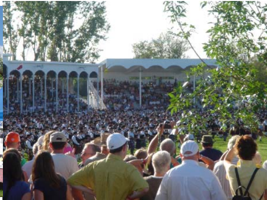
Crowds at the Main Grand Stand