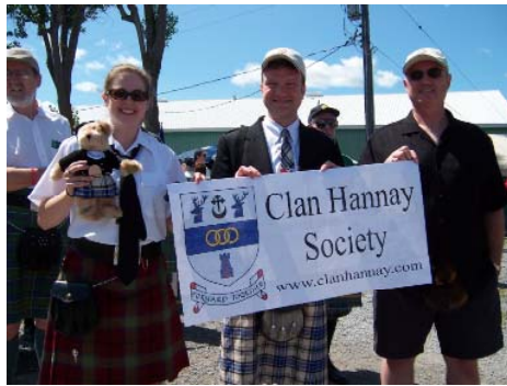
Clan Hannay "Parade" Group