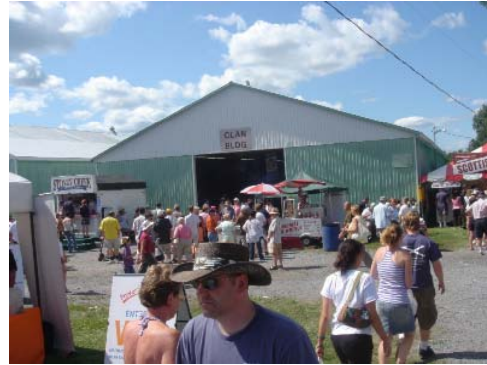
The Main Clan Building