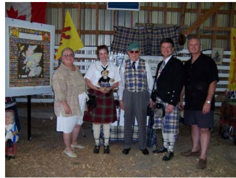
The Clan Hannay at Maxville