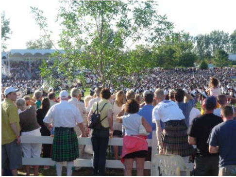
Massing of the Bands

The Glengarry Games is well known in Canada and the United States, with many visitors coming from the north eastern US and all of Canada. The main day of the Games was Saturday featuring the finals of athletic and band competitions, as well as traditional music, dancing and food! Over 30,000 people were in attendance on Saturday, with temperatures around 30° C and sunny skies.