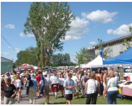
Crowds along the Vendor Walkway