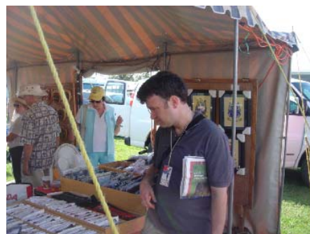
Reviewing a Vendor's Wares